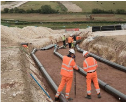
NG - Construction best practice for underground cable installation

Overleaf is NG's proposed routing through the Dedham Vale AONB. Don't be fooled by the simple dotted line. Where the route splits there will be