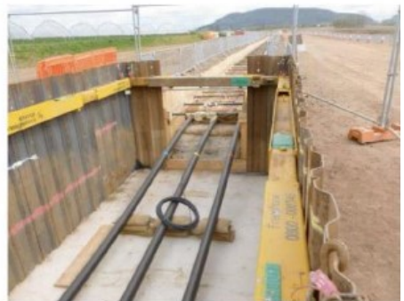
Direct|buried cable installation in a rural area