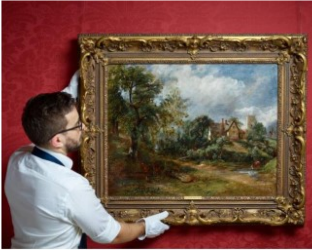
The Glebe Farm c.1828 John Constable (5 th v)

sensitive landscapes and vital wildlife habitats. Make no mistake, however temporary the works, post construction the changes will be permanent and will be experienced for generations. And if NG's own studies are to be believed it seems that all this is completely unnecessary.