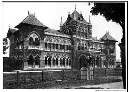
The Cama Hospital, Mumbai