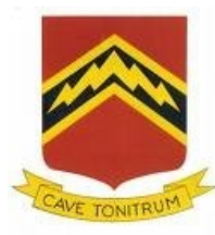
Left to right: 386 Bombardment Group; 354 Fighter Group; 56th Fighter Group;