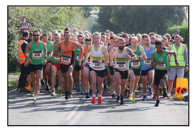
Start of 10k race