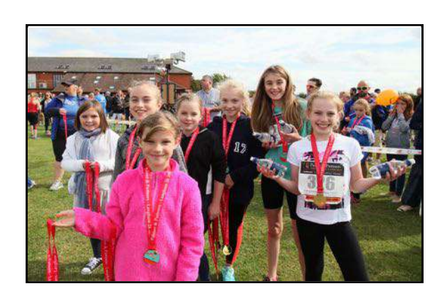
The Water Girls!

The Langham, 2k, 5k and 10k race, probably the biggest event in Langham, took place on Sunday,10th September. The event attracted more than 2,000 people from across the district with 1200 of those runners in the 3 race categories.